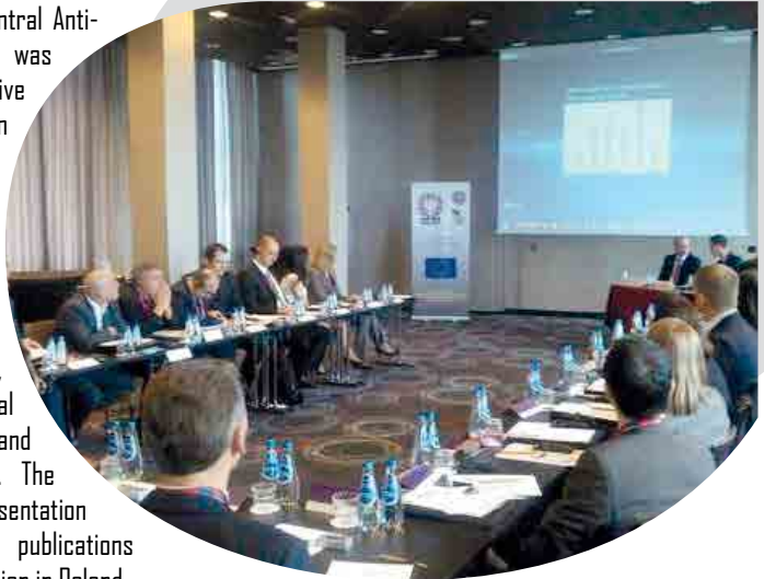
Photo 4: The 4th Seminar Session on "Rising of Anticorruption Training System"

This meeting gave the opportunity to the Central Anti-Corruption Bureau officers to share their experiences in the field of collecting data with the audience – in cooperation with other Polish law enforcement authorities – in order to create the most authentic assessment of the state of corruption in national economy sectors most prone to corruption. The aim was to publish the so-called Map of Corruption for the years 2010, 2011, 2012 and 2013. The next point on the agenda was to present the methodology and the results of final cooperation