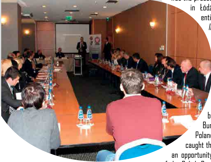
Photo 2: Panel sessions during the 2nd Seminar Session on the "Rising of Anticorruption Training System"

Among those taking part in the international meeting was the prosecutor from the Prosecutor's Office in Łódź who delivered a presentation entitled Legal aspects of bribery – legal characteristics and case study . The topic presented by the prosecutor was particularly interesting since it was delivered from the perspective of the Prosecutor's Office – the guardian of the rule of law and the institution supervising procedures conducted inter alia by the Central Anti-Corruption Bureau and the National Police in Poland. The presentation instantly caught the delegates' attention as they had an opportunity to compare the role and tasks of the Polish Prosecutor's Office and those of the Prosecutor's Office in Azerbaijan. A Senior Prosecutor of the General Prosecutor's Office of Azerbaijan gave a presentation on the anti-corruption legal solutions in Azerbaijan. In addition, a representative of the Department of Control Proceedings of the Central Anti-Corruption Bureau, in his report entitled "The participation of the Central Anti-Corruption Bureau in preventing conflicts of interest and disclosing corruption cases by controlling asset declarations" , shared his insights with participants, which also drew a lot of interest among foreign delegates.