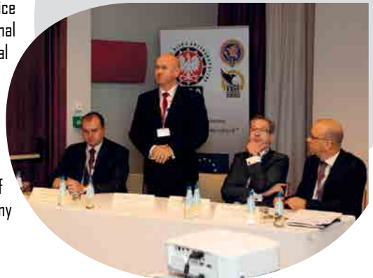
Photo 1: Opening of the 1st Seminar Session – Head of the Central Anti-Corruption Bureau, Deputy Head of the Prosecutor General (Poland) and the representative of the Special Investigation Service of the Republic of Lithuania