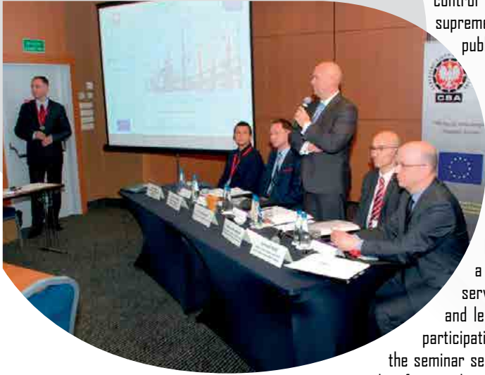
Photo 3: Opening of the 3rd Seminar Session by the Head of the Central Anti-Corruption Bureau (CBA), Director of the Austrian Federal Bureau of Anti-Corruption, Director of the Regional Branch of the Supreme Audit Office (Poland) and the representative of the Special Investigation Service of the Republic of Lithuania

who familiarised the participants with the role and tasks of the Polish Supreme Audit Office (NIK) in the field of public procurement control from the perspective of the supreme governmental organ “guarding public finances”.