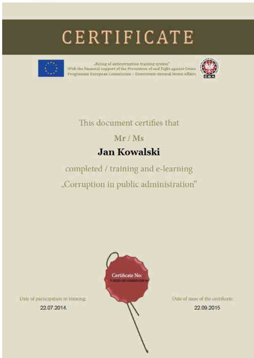
Slide 4: Sample certificate

authenticity of the certificate on the platform, without having to log in.